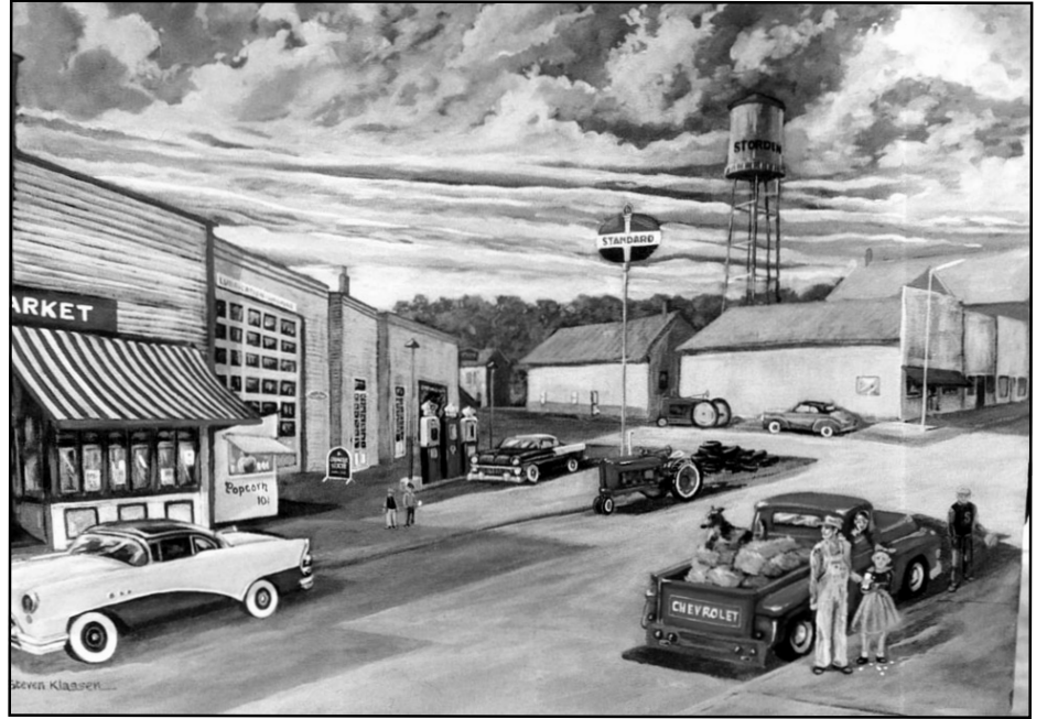
1950's Portrait of Main Street in Storden by Steven Klassen available for purchase at Deb's Hair Design for $50.00